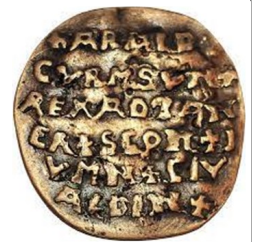
The Curmsun Disc