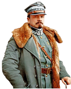
General Józef Haller

As part of this year's 75th Anniversary Convention of the American Council for Polish Culture, (which is being held July 26 to 29 in Troy, Michigan), there will be a visit to the newly dedicated monuments erected at the Holy Sepulchre Cemetery in Southfield, Michigan honoring 59 members of the "Hallerzczy," the brave men who fought in World War I as part of General Józef Haller's "Blue Army."